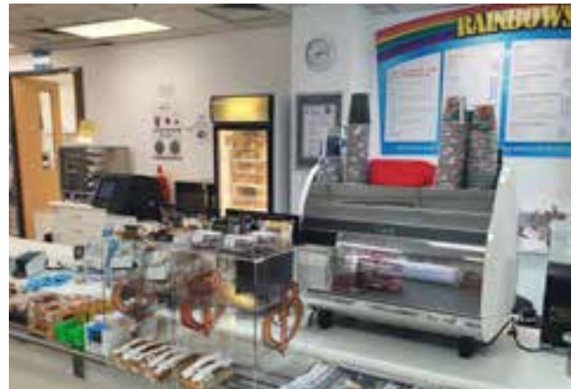
Rainbows Shop after recent refit and installation of new coffee machine.