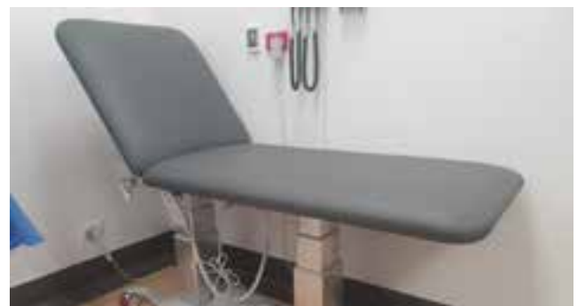
One of the new Outpatient Treatment tables designed in consultation with the WCH Biomedical Engineering team.

This year the Friends continued with our goal of replacing all WCH outpatient room Treatment Tables due to entrapment concerns, which were identified with the old scissor lift style. Thanks to the efforts of our committed members $71,450 was donated to support the purchase of 25 new tables.