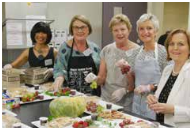
Members of the Queen Victoria Auxiliary committee preparing for the Wine and Cheese night.

President, Queen Victoria Auxiliary Division Friends of the Women's and Children's Hospital Inc.