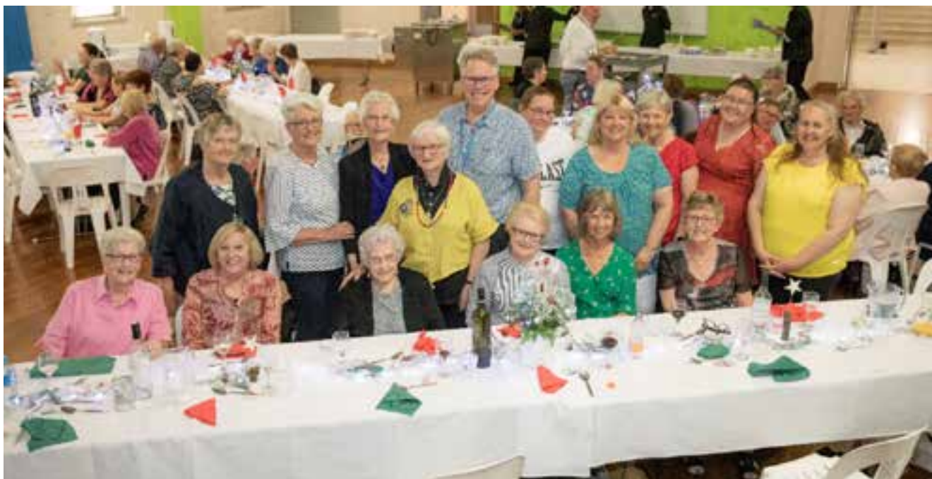
Members of the Shops Auxiliary Division enjoy the 2019 Christmas Lunch provided by the Women's and Children's Hospital.

President, Shops Auxiliary Division Friends of the Women's and Children's Hospital Inc.