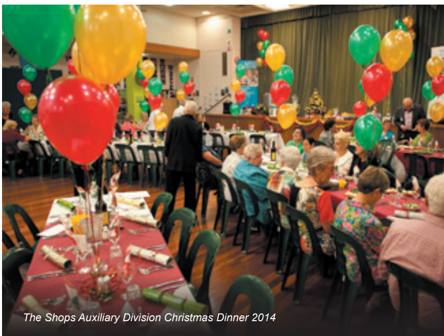
The Shops Auxiliary Division Christmas Dinner 2014

Congratulations to our new life members who received this recognition at the 2014 Annual Conference and to all the Shops volunteers receiving service badges and certificates for hours worked.